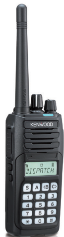
Full Keypad model