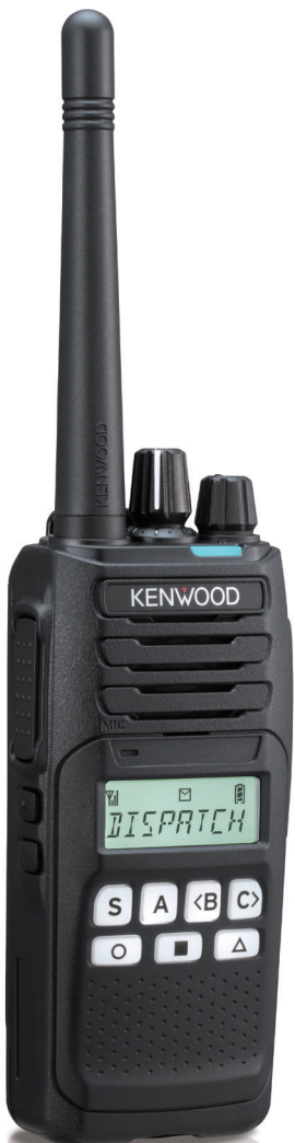
Standard Keypad model

If you are thinking of harnessing the latest digital protocols – NXDN or DMR – to enhance business efficiency or FM analog for its simplicity, the NX1200A-E/1300A-E has you covered. Our One-“K”-Fits-All solution offers the widest selection of two-way radios for everyday use. The model matrix also includes basic and keypad variations, with or without a high-contrast backlit LCD. Other features include a 7-color LED indicator and the popular KENWOOD 2-pin audio accessory connector. Plus, mixed-mode operation ensures seamless integration with legacy radios while smoothing the onward migration path to digital. But whatever your specific needs, audio quality is what determines clear voice communications – which is why KENWOOD radios are used under the most grueling conditions, like the cockpit of a racing car. Thanks to our extensive experience with professional systems, reliability is second to none. So whatever your radio requirements, KENWOOD’s NX1200A-E/1300A-E offers a single platform that’s right for you.